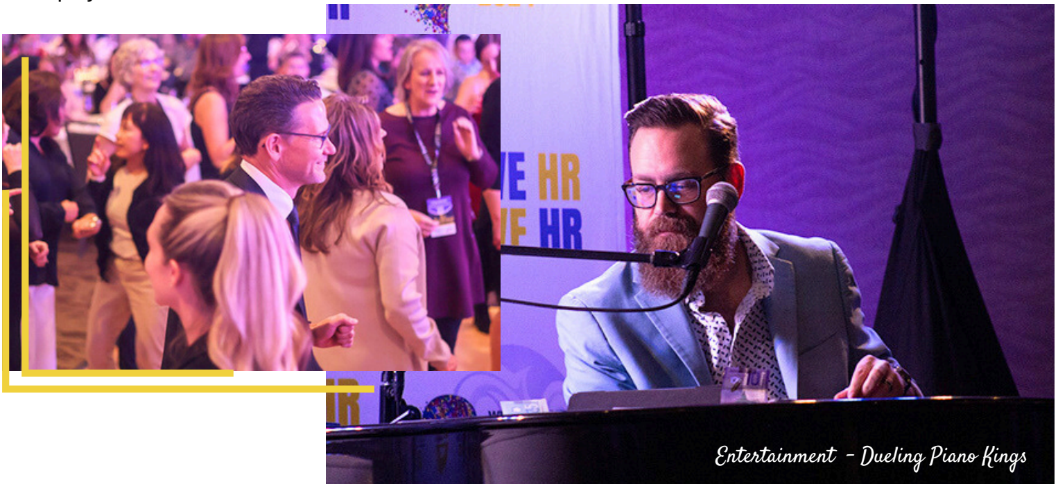
Entertainment - Dueling Piano Kings

Your company introduced as the session sponsor, company logo displayed on the screen and the sponsor can briefly introduce company services and the session speaker.